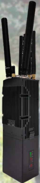
2Watts×2 +5G Routing