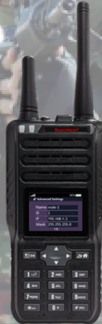
1T2R Dual-band Switching