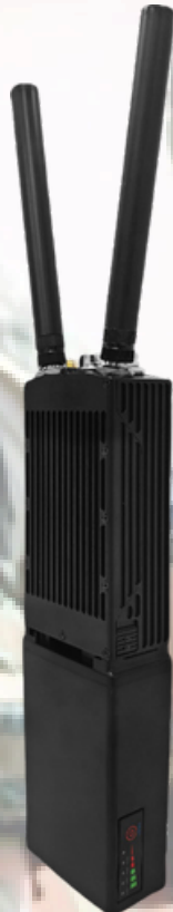
4Watts×2/5Watts×2 +Longer Battery