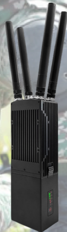
Dual-band Operation Simultaneously/ULSC Four-band Selection Operate