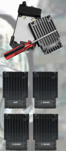
ULSC Modular Amplifier